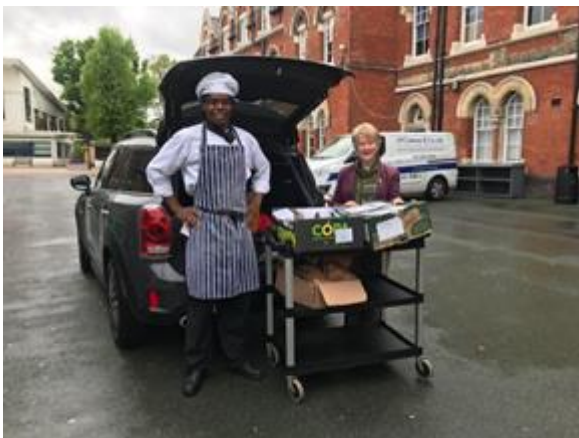
local partner primary schools

With the advent of the Covid-19 pandemic, we focused our fundraising on local initiatives to support those most impacted in our community.