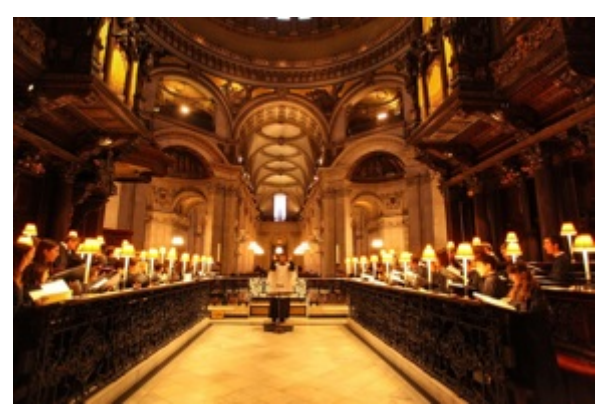
anthem Blessed be the God and Father.